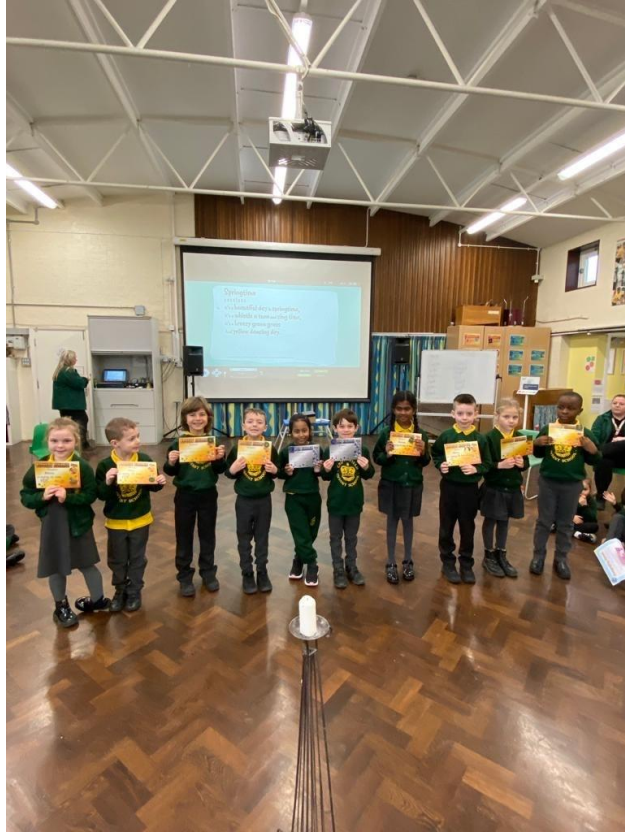
3 - Reading Awards